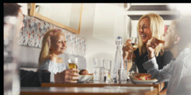
Bistro at The Distillery

THE NATURE OF OUR ART IS WHISKY, THE INSPIRATION OF OUR ART IS NATURE.